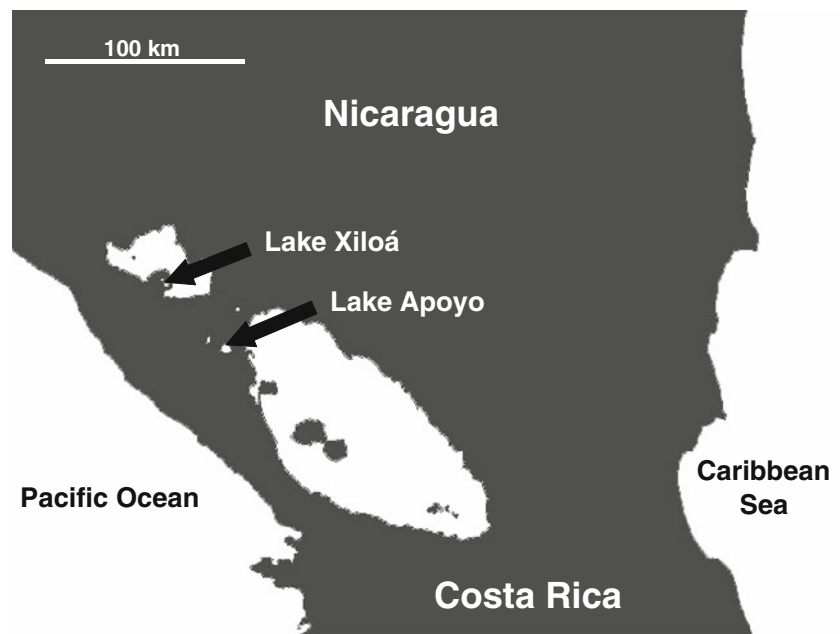
Fig. 1 Apoyo and Xiloá are crater lakes, i.e. volcano calderas that have filled with water

or paired) were recorded. For a subsample ( n=25\text{--}33 for all species except Amphilophus xiloaensis ; Fig. 2), we also approximated total lengths of the parents and calibrated our approximations by catching one to four individuals of each species for exact length measurements. In these cases, we tended to overestimate the length of the fish, but never more than by 1.5 cm.